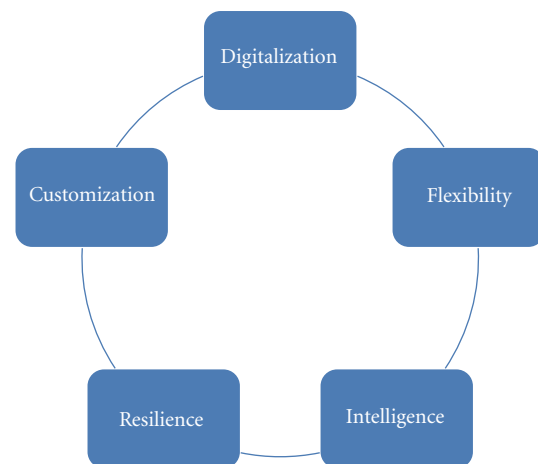
FIGURE 2: Smart grid properties.

technology. Resilience would mean that the system should not be affected by any attacks. And lastly, customization means the system needs to be client tailored.